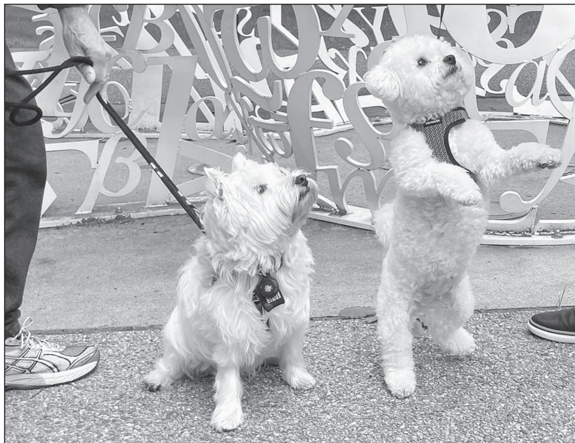
Duchess Poppy and Lady Cha Cha accompanied us on the MIT art collection tour.

Several parks include artwork, and their maps include basic information on each work. The most