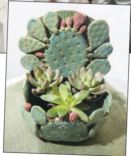
The StoveFactory Gallery was filled with visitors for the exhibit of Art: A Visual Feast. Right, is Prickly Pear by Tina Busa. See pages 6 and 7 for more photos.