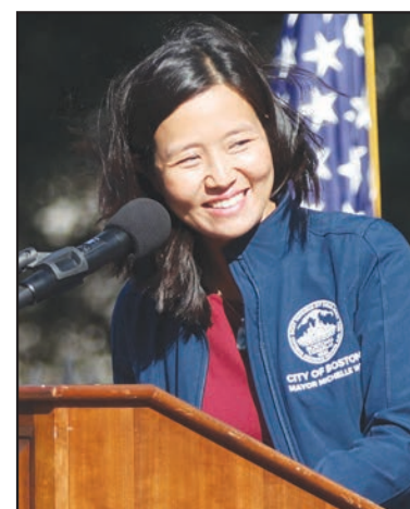
MAYOR'S OFFICE PHOTO BY JOHN WILCOX

superior British Army. The fierce fight demoralized the British and accelerated the movement toward American independence.