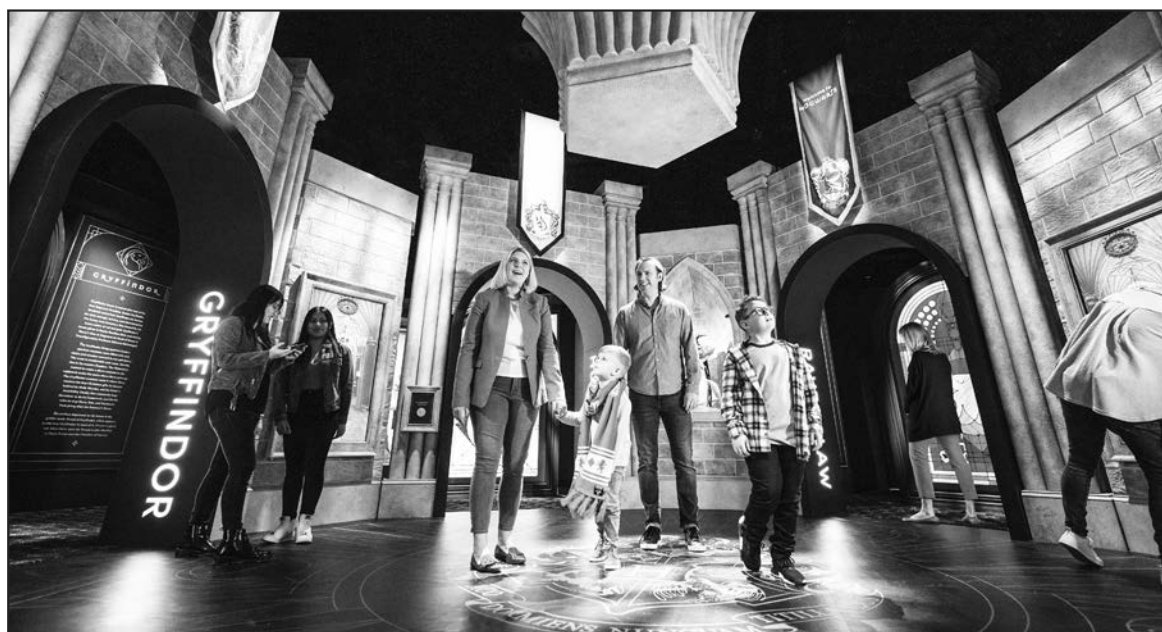
A family exploring the various Hogwarts houses.