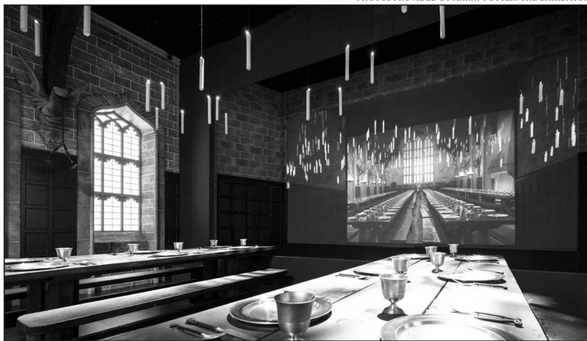
The Great Hall offering the illusion of depth.