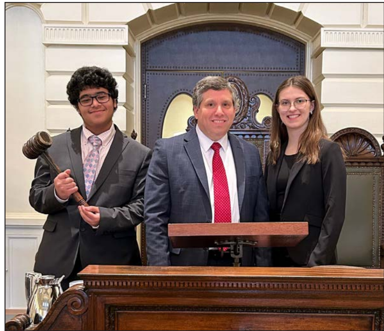
Senator Sal DiDomenico with students in the Senate Chamber.

Elementary and Secondary Education and open to high school juniors and seniors.