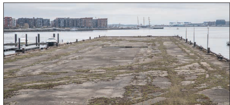
Pier 5 is truly a Charlestown treasure waiting to be realized.