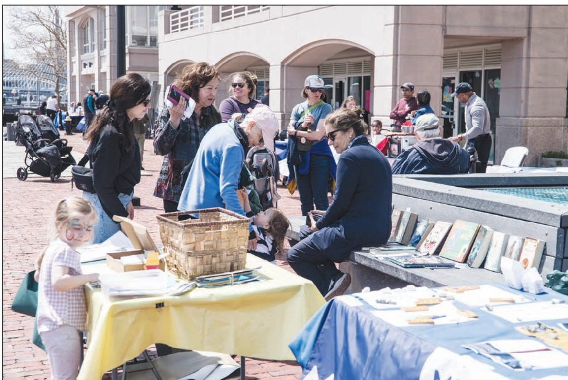
The weather brightened up for a perfect day at Pier 5.