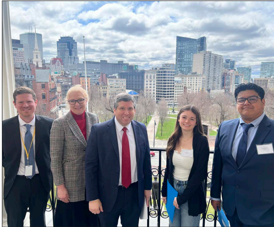
Senator Sal DiDomenico with students and teachers on the Senate Balcony.