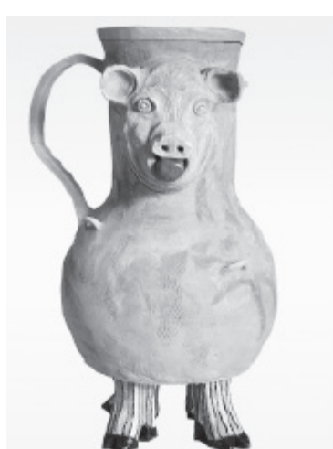
Shown: Joe Caruso, Prosciutta, 2023 Clay, glaze, acrylic, and epoxy

"DIG" opens at the Art Complex Museum on May 12, 2024