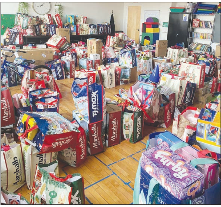
People and businesses were generous with donations for the Holiday Drive.

(617) 241-8866 ext. 1352 or email cgalvin@kennedycenter.org or visit www.kennedycenter.org .