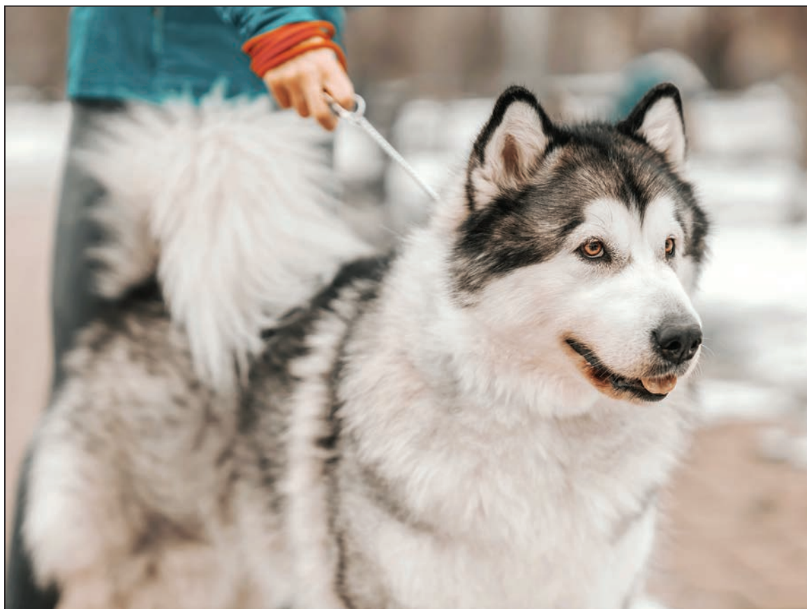
AKC says for a sleddog, "A healthy coat with a thick undercoat helps keep a dog warm and protected from the elements and preserves those essential calories."

The seasonality of a dog depends, in part, on genetics and breeding. A dog's body, tail, coat, and personality depend on the work humans refined the breed to perform. Among the best exam-