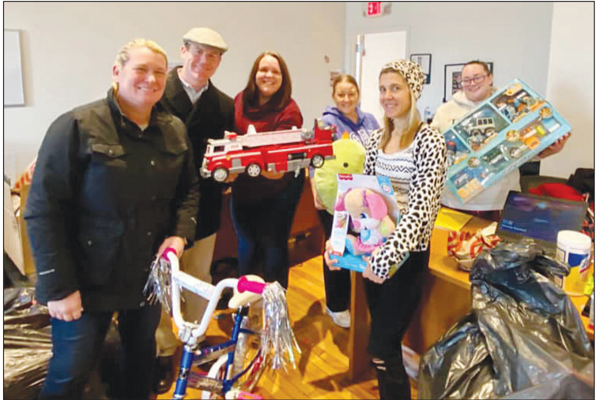
Volunteers from the Warren Tavern helped to organize the donations.