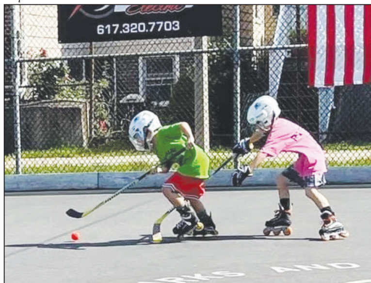
Players from the Junior Division squared off early Saturday morning.