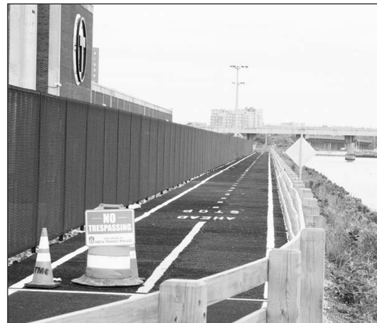
The pathway on the Mystic River seawall.

“A surface cross-over is just not safe,” he said. “A pedestrian bridge across would be the other possibility, but the elevation and the needed ramp/stairs would be difficult given the space limitations. That only leaves one option, going under, and having a fully sealed submarine tunnel, but that’s going to be expensive. If, and that’s a big if, we need the Feds to come through with funding for climate readiness, then we should be able to get it added in.”